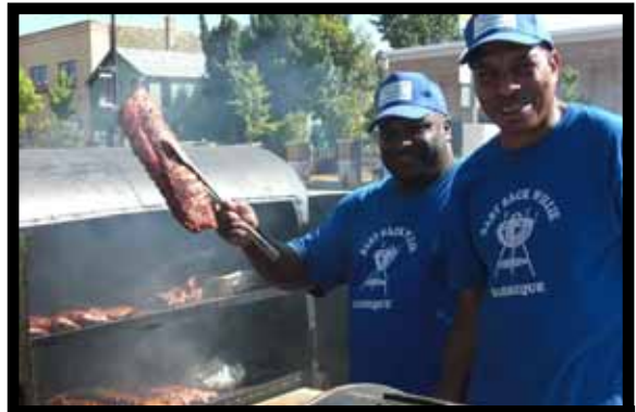
National and Local Competitors will participate in the KCBS Sanctioned Brew City's Best BBQ Competition & People's Choice Awards