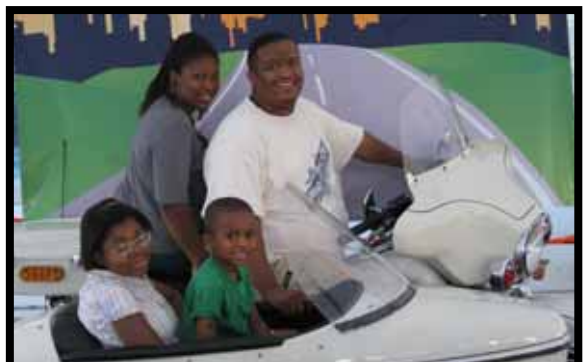
Family Fun Area will feature "take your picture on a Harley," Harley Temporary Tattoos, Balloons, Face Painting and a Coloring Area