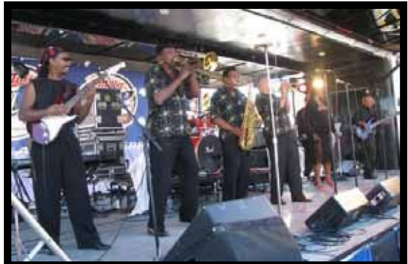
Music Stage will feature non-stop entertainment featuring classic rock, reggae and R&B