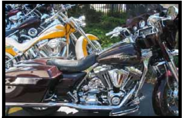
Bike & Car show will feature high-end custom detailed bikes and cars, with awards for the people's choice winners